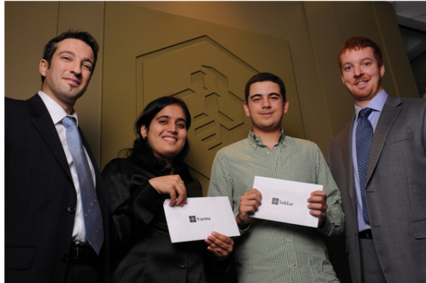
Desjardins Team and 2009 scholarship laureates

The application form for this year will be available on our Web site shortly. Make sure that your clients send the required forms before August 31, 2010 .