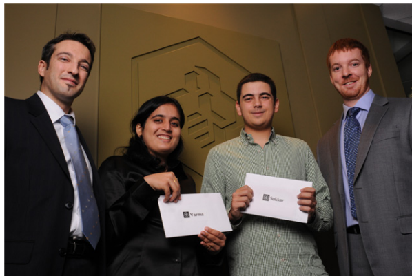
Desjardins Team and selected 2009 scholarship laureates

The application form is available on our Web site. Make sure that your clients send the required forms before August 31, 2010.