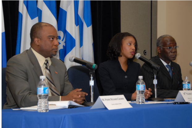
Pierre Richard Casimir, Consul General for Haiti | Minister Yolande James, MICC | Emmanuel Dubourg Député de Viau

However, the 2010 total immigration quota will not be increased in order to guarantee the stability of the immigration system. In line with its capacity for new arrivals the program will thus allow 3,000 Haitians to immigrate to Québec.